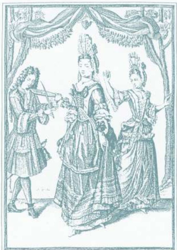
Fille de qualité apprenant à danser

Their teaching experience ranges from regular classes & courses in North Sydney to lectures, workshops & masterclasses presented for arts & education institutions around Australia & overseas.